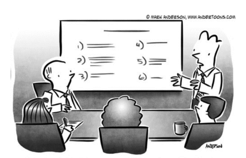
"You're right, it is easier said than done. That's why I said it; because it's easy. Try and keep up."

But the fact is, by outsourcing the work, you save money while keeping out the bad guys optimizing key parts of your network and software. It's a win/win. It's all about being proactive. When you have a group of experts working every day behind the scenes, cyber security stays top of mind in your organization, whether you're thinking about it or not. Really, it's one less thing you have to stress about.