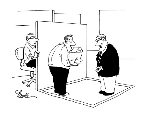
"Your cubicle is on back order, so for the time being, work within these chalked lines."