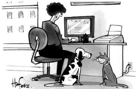
"I think we're named after computer passwords."

Taking it a step further, you can mix AI with human communication. Chatbots are more advanced than ever and can seriously impact lead generation. Chatbots also direct users to real people to continue the conversation on specific terms. Basically, there are more ways to customize how you communicate, and it's worth investing in. Forbes , 3.12.2021