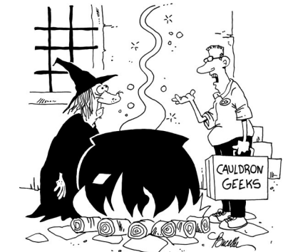
"It's a conflict between your hardware and your software. Your cauldron won't support Eye Of Newt 3.0."