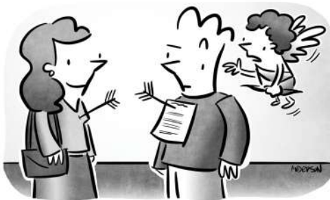
"If you could fill out the attached survey that would really help me out."